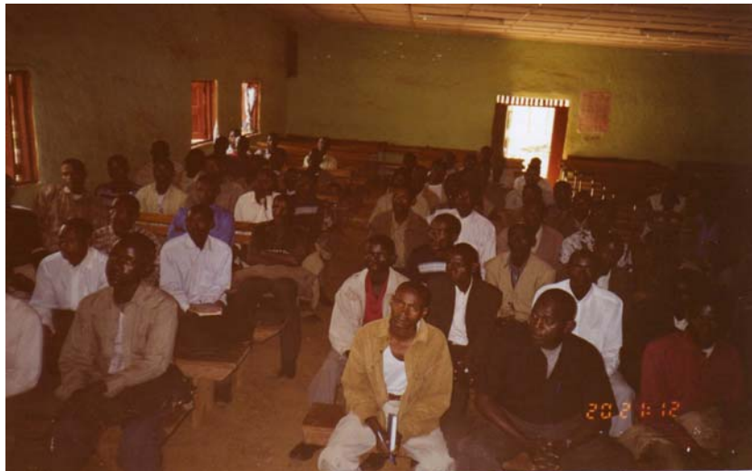
Tent Making Ministry—Training Workshop conducted by a professional from Local Government