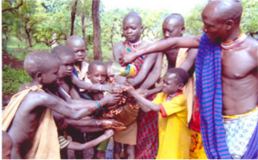
Picture IV. Suri Literacy students learning about personal hygiene practically by their rural literacy teacher.